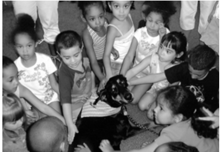
Library program: Bailey is surrounded by young readers