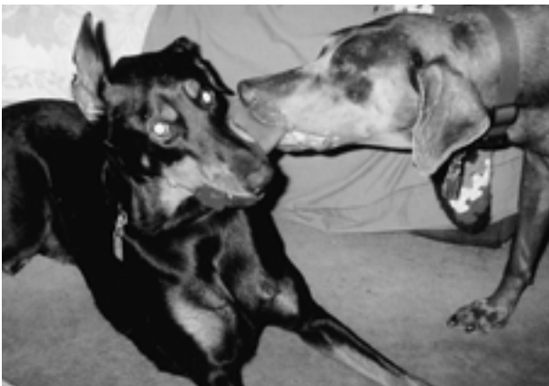
Twister with his pal, Buddy.